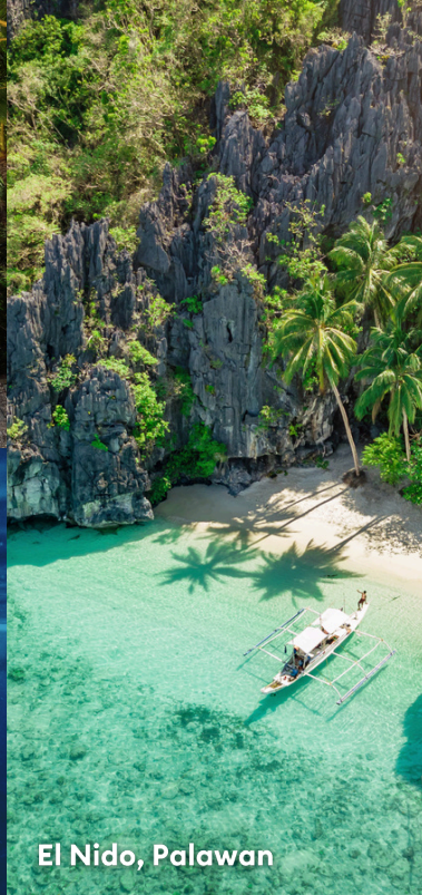
El Nido, Palawan