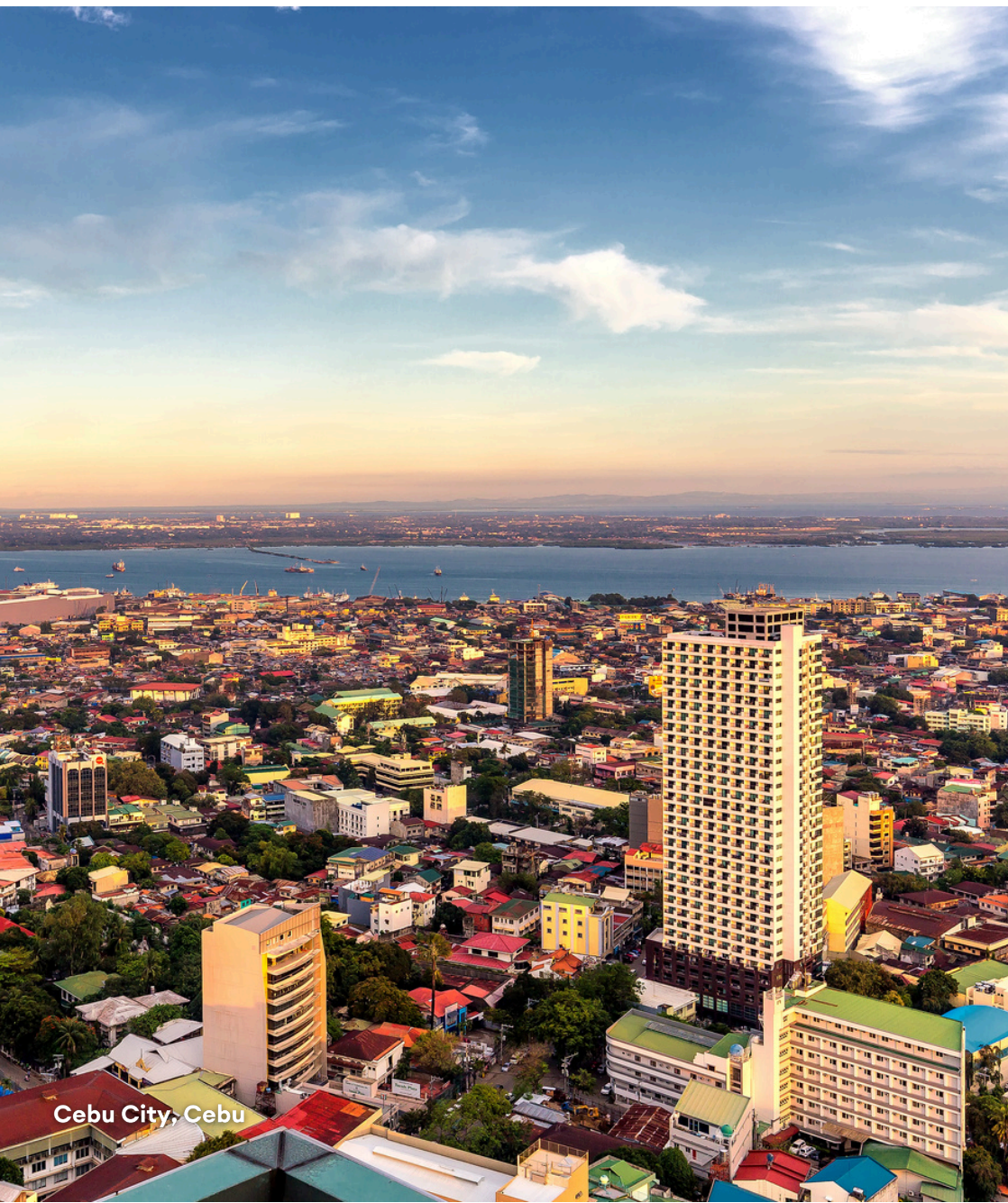
Cebu City, Cebu