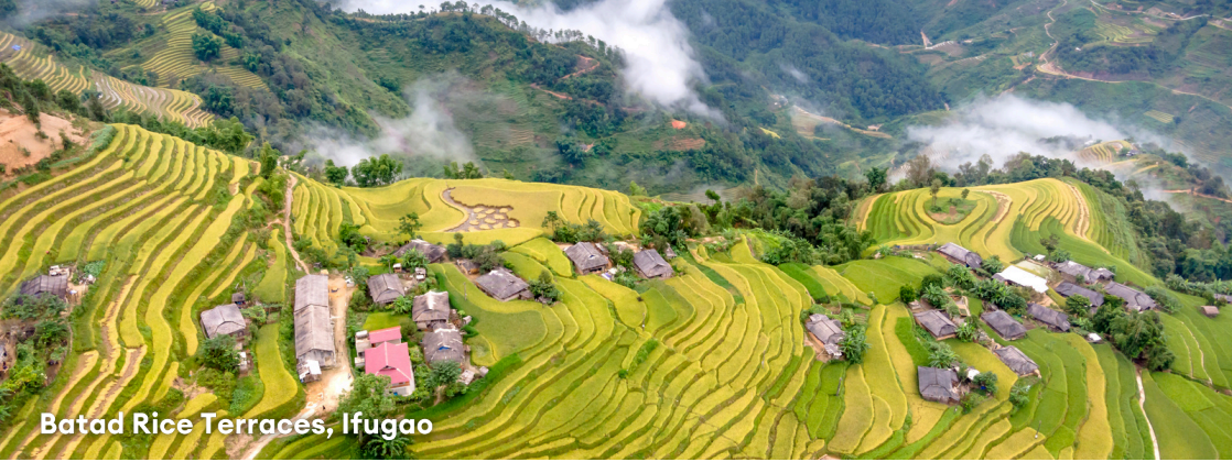
Batad Rice Terraces, Ifugao