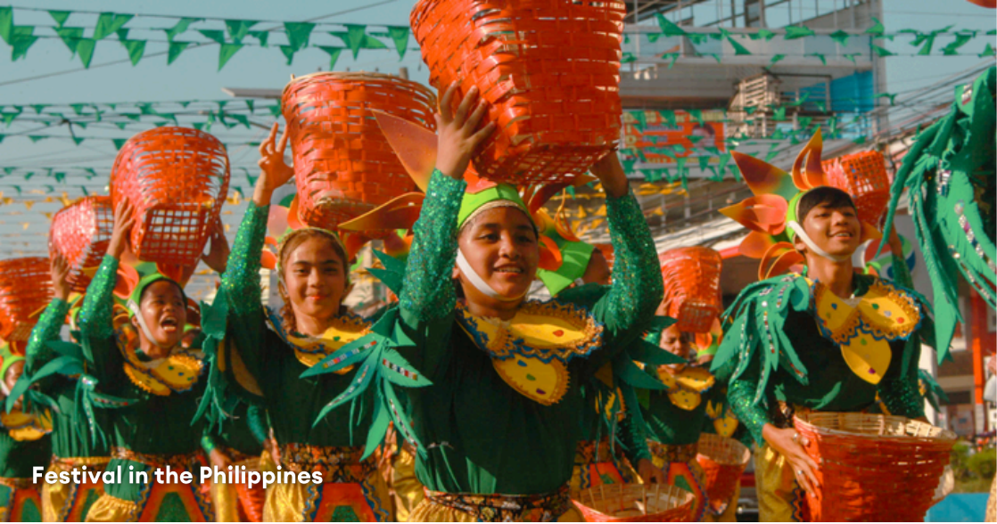
Festival in the Philippines