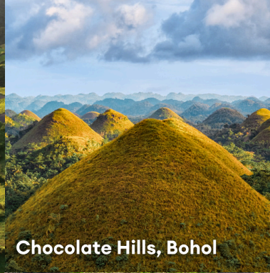
Chocolate Hills, Bohol