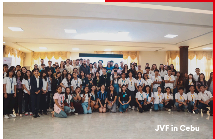
JVF in Cebu