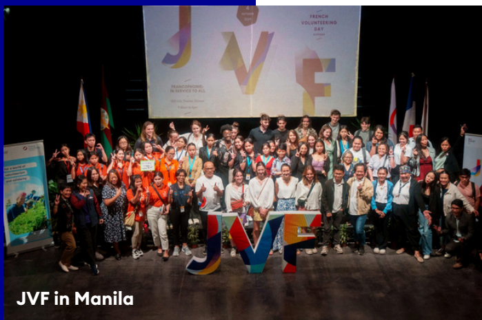
JVF in Manila

On the eve of the JVF, the Rizal National Monument was illuminated into the colours of the French flag: blue, white, and red; while a special lights and sound show transformed the Musical Dancing Fountain in Rizal Park into the colours of France & the OIF accompanied by selected Francophonie music on the background.